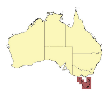
Distribution of the Green Rosella

Ensure that you observe the box from a distance or through a window, as Green Rosellas may desert the nest if they feel they are being watched. Unless you see an introduced bird moving into the nest box, resist the urge to lift the lid and look inside. If you disturb the birds then they may abandon the nest box. Only open the lid to remove unwanted invaders.